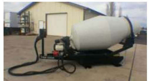
REMOTE CONTROL PANEL (OPTIONAL)