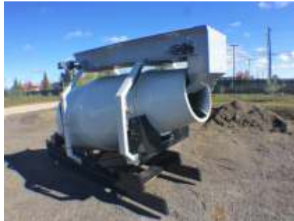
TOPLOADER CONVEYOR LOADER (OPTIONAL)